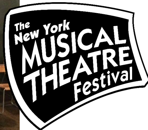
Guilin Reading Cast – New York City